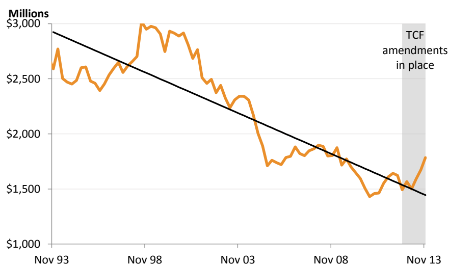
Figure 2: Nominal sales revenue in the textile, leather, clothing and footwear manufacturing industry subdivision

Source: ABS 2014, Business Indicators, Australia, December 2013 , Table 25, Catalogue number 5676.0 and ACTU calculations.