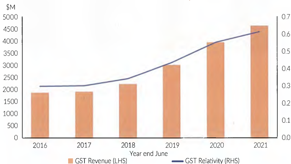
Chart 2: Western Australian GST revenue and relativity forecasts, 2017-18 to 2020-21