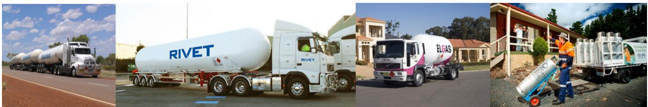
Figure 2 –Road train, Semi-trailer, Bobtail and Cylinder delivery truck highlights the diverse range of vehicles in the distribution system

A national approach is vital to the gaseous fuels industry and GEA supports a national system that includes all states and territories not derogating national law or inconsistently applying it.