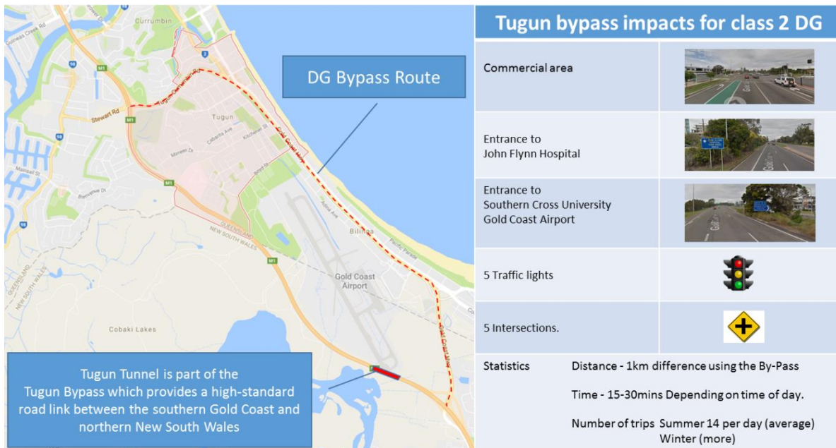
Figure 3 - Tugun Tunnel Bypass