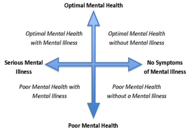
Figure 1: The Mental Health/Illness Continuum

In concurrence with the widespread understanding that has developed in the field of psychology over the past two decades, mental health is not just the absence of illness but is the presence of the characteristics of positive mental health. This understanding is now also a core feature of the recovery approach in mental health 20 . There is also a growing body of evidence that positive wellbeing improves productivity 21 . Another way of understanding this difference is to see mental illness and health as two separate dimensions 22 (Figure 1)