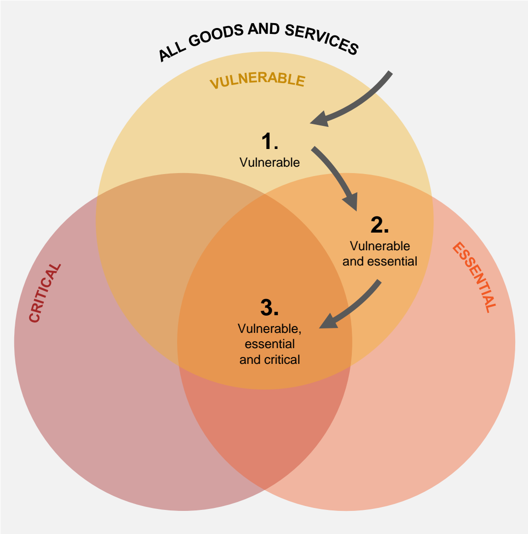
Figure 1 The Commission’s analytical framework

The Commission’s method differs from the approach of relying exclusively on expert consultations to identify essential sectors and the key inputs that may be at risk. One of the strengths of first applying a data scan is that it is largely agnostic (a priori at least) on those products likely to be identified as vulnerable to disruption. This reduces the probability of