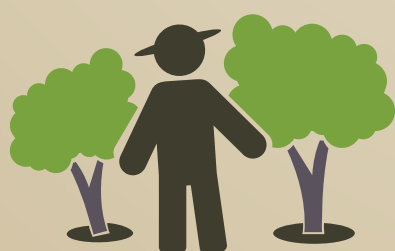
NATIVE VEGETATION AND BIODIVERSITY CONSERVATION