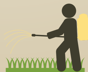
AGRICULTURAL AND VETERINARY CHEMICALS