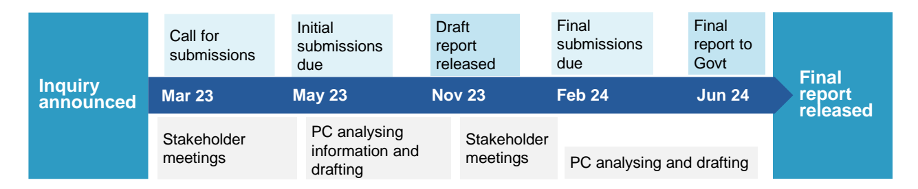
Figure 1 - Key steps in the inquiry

Further information on the inquiry and how to provide a submission or comment is available at www.pc.gov.au/inquiries/current/childhood or by contacting Yvette Goss on 03 9653 2253.