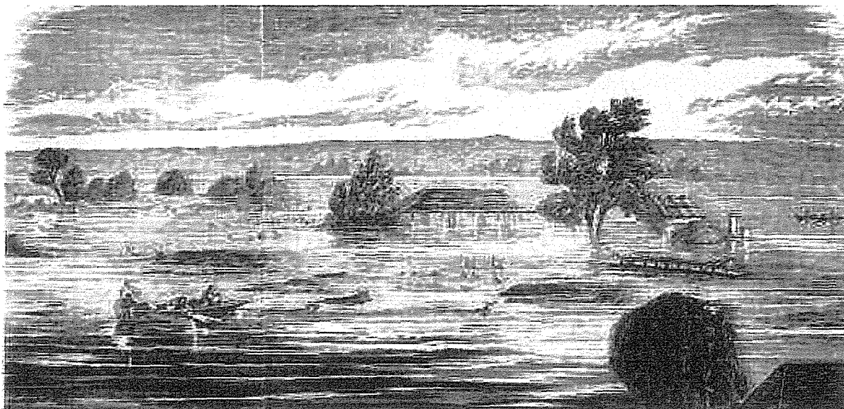
Ryans Punt near Windsor