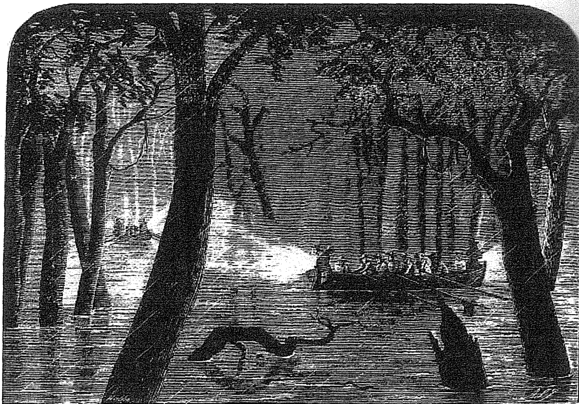
Rescue boats rowing through the bush at night