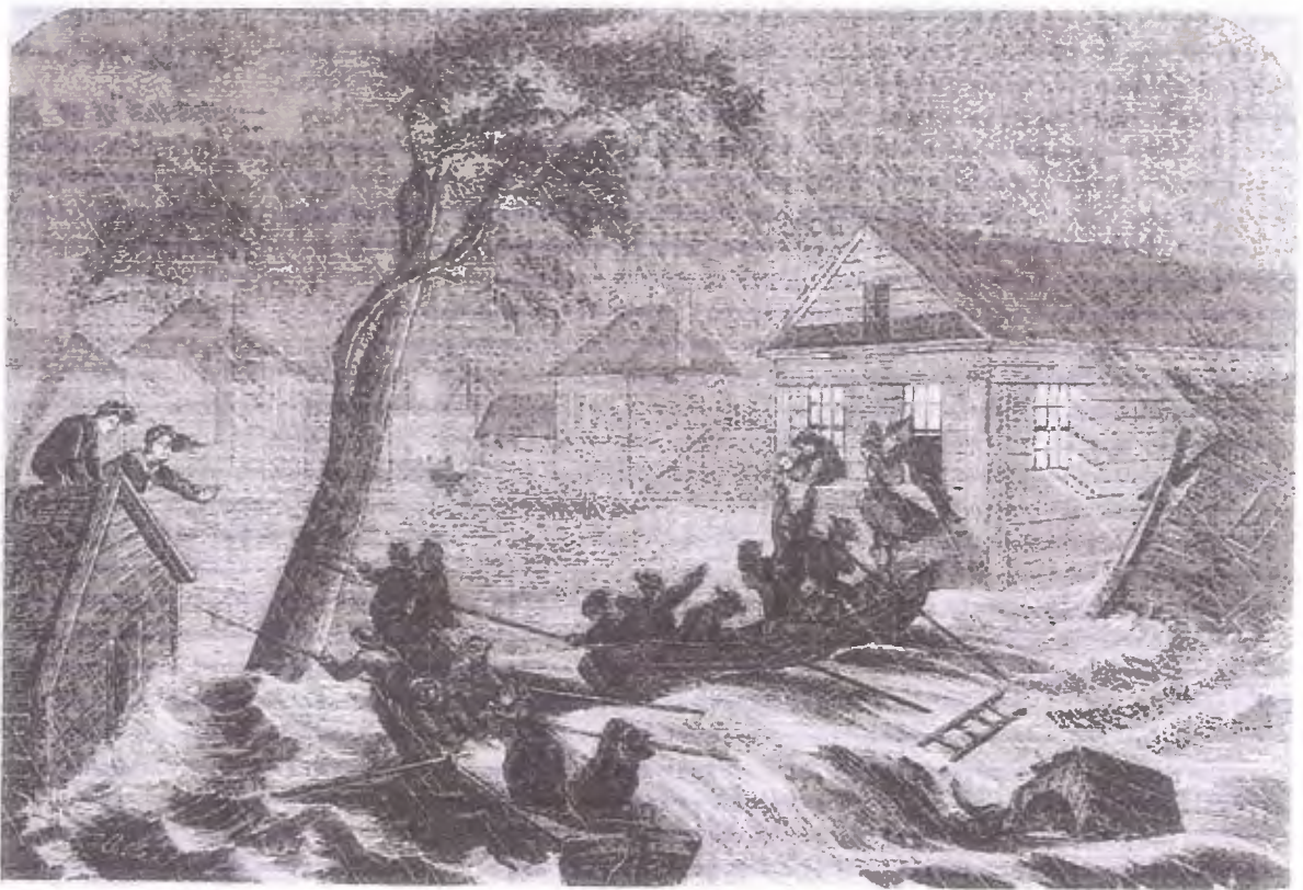
Night rescue scene