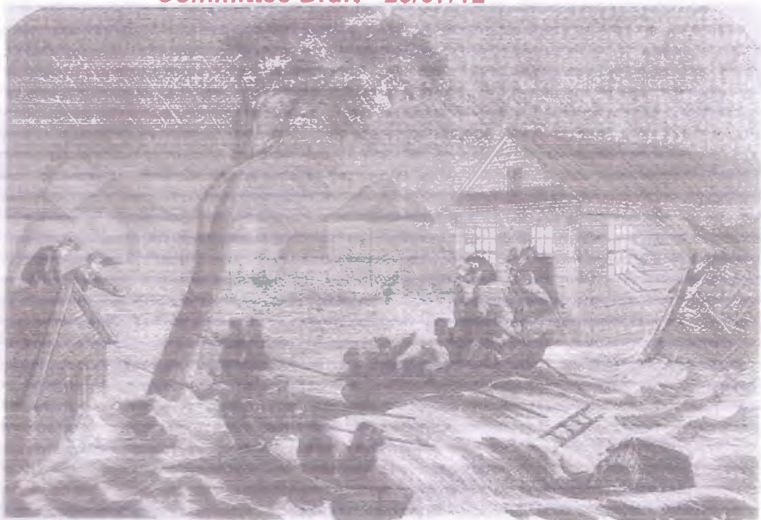
Drawing of night-time rescues during the 1867 Hawkesbury River flood