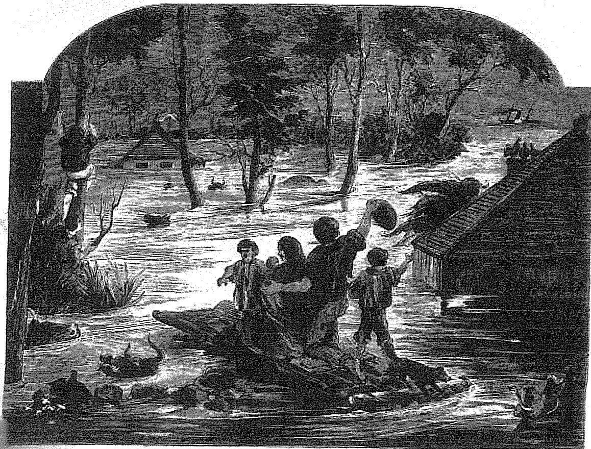
Each scene during the floods