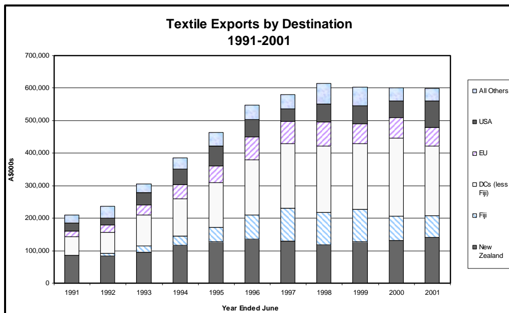
Chart 2: