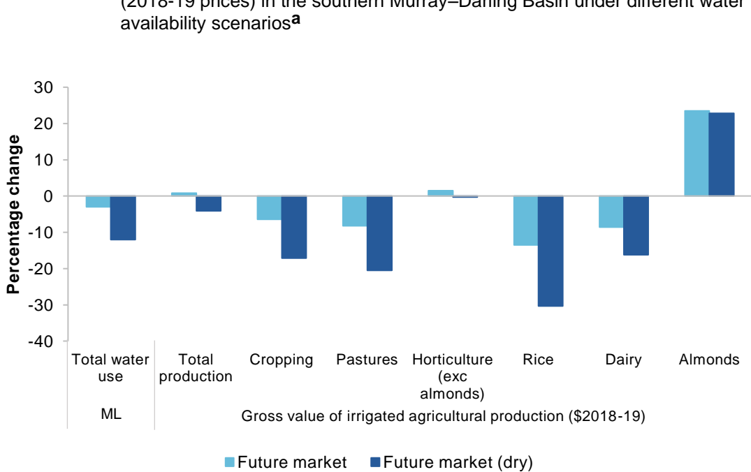
Figure 2 Maintaining production with reduced water use

Average annual water use and gross value of irrigated agricultural production (2018-19 prices) in the southern Murray–Darling Basin under different water