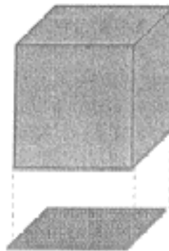
Figure 11.1 Standard Trading Units

Standard Trading Units are like cubes of spectrum space. In the area dimension, the SMA created a ‘spectrum map grid’. This is a grid of parallels of latitude and meridians of longitude that defines 21 998 cells. These cells exist in three separate sizes, depending on population density: